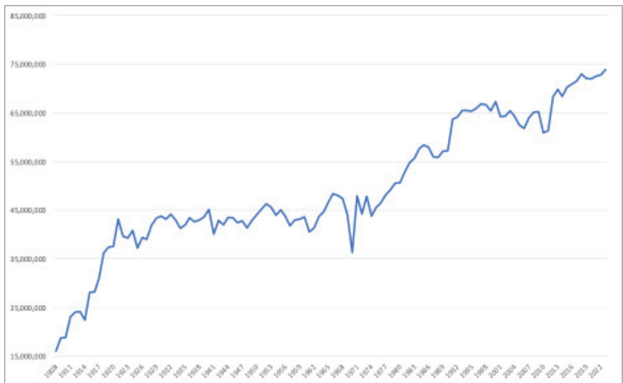
Figure 3. Total Seeded Acres, Principal Field Crops in Canada, 1908–2013

Aside from the advent of genetically modified crops, innovations in farming have facilitated a dramatic increase in the amount and quality of food produced by the Canadian agri-food sector over the last several decades. A good deal of this increase is due to improvements in agronomic practices; one very big-picture example of this is the large-scale abandonment by Prairie farmers of the practice of summerfallowing. Under this practice, as much as half of a producer's land would remain fallow (i.e., not have a crop sown upon it) in any given crop season. As agronomists (mostly soil and crop scientists) recognized that contrary to the long-held belief that "resting" a plot of land would provide some kind of mystical regenerative benefit, this practice was in fact contributing to soil erosion, increasing soil salinity and resulting in a loss of both soil moisture and soil nitrogen. Extensive research and subsequent education efforts were made toward the practice of continuous cropping. Spicer (2009) estimates that as recently as 1991, as many as 20 million acres were being summerfallowed in Canada. For 2023, acres under fallow were reported to be only 1.319 million (Statistics Canada 2023b) — a reduction of around 95 per cent in the last 30 years. This reduction has helped lead to historic seeded acreages of field crops. As Figure 3 shows, in 2023 Canada had its highest-ever areas seeded to principal field crops, of just under 74 million acres.